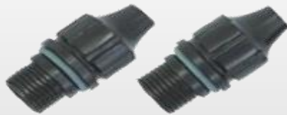
Hand Piece Top