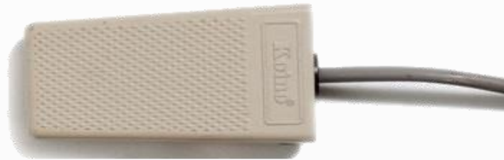
Foot Paddle with cable